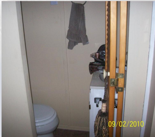
Bathroom in a closet