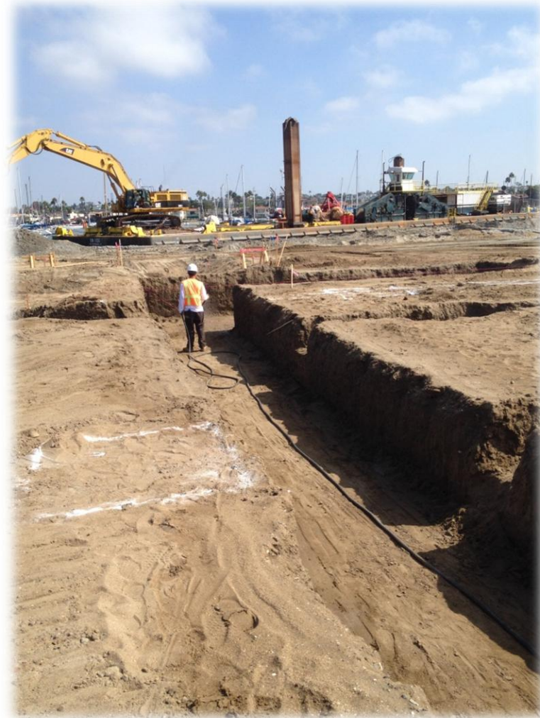
Building Foundation Excavation