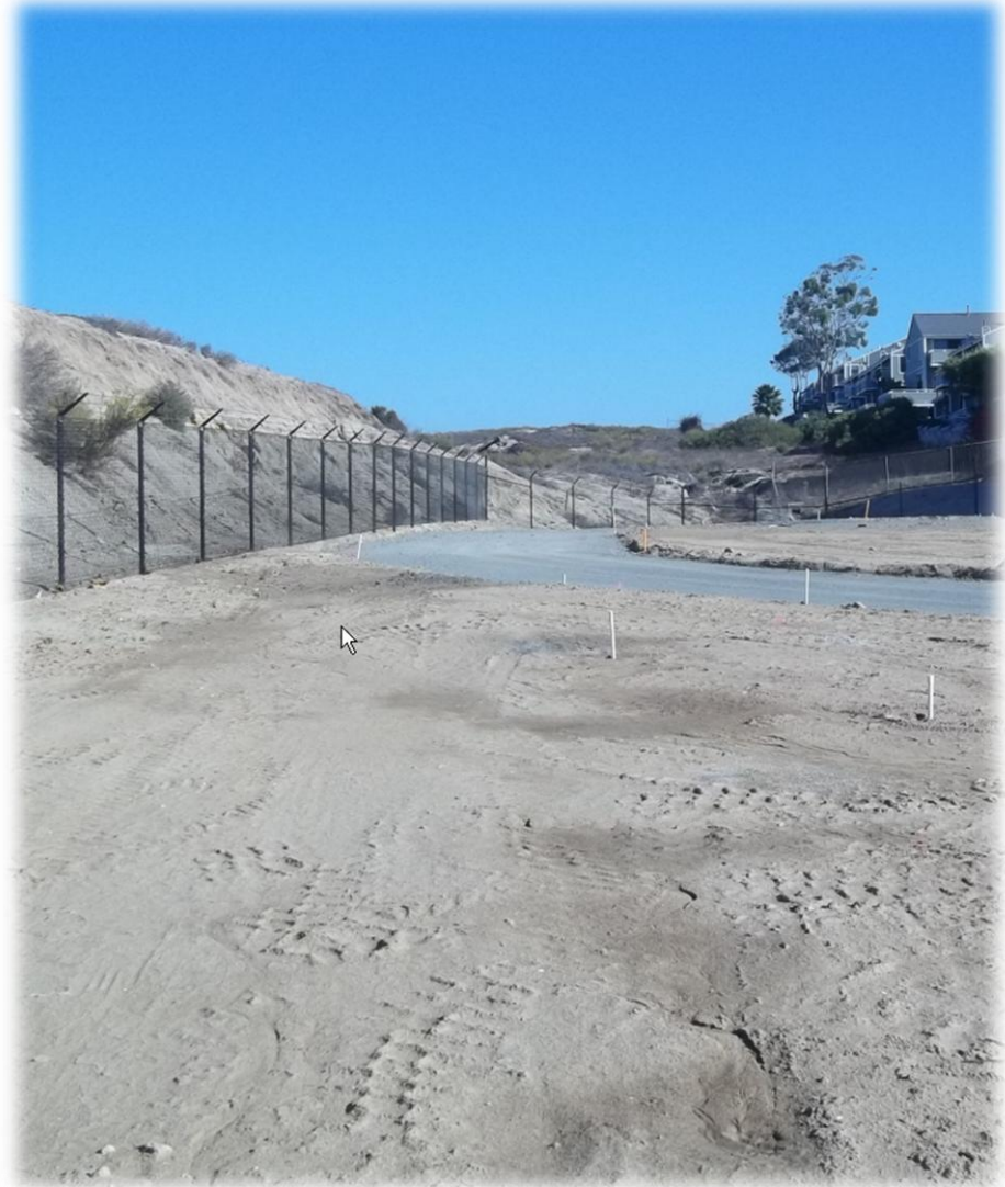
New Buried Concrete Storm Drain Pipe