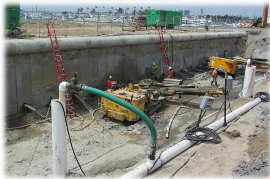
Tieback Rod Installation