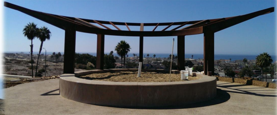
Overlook Trellis Structure