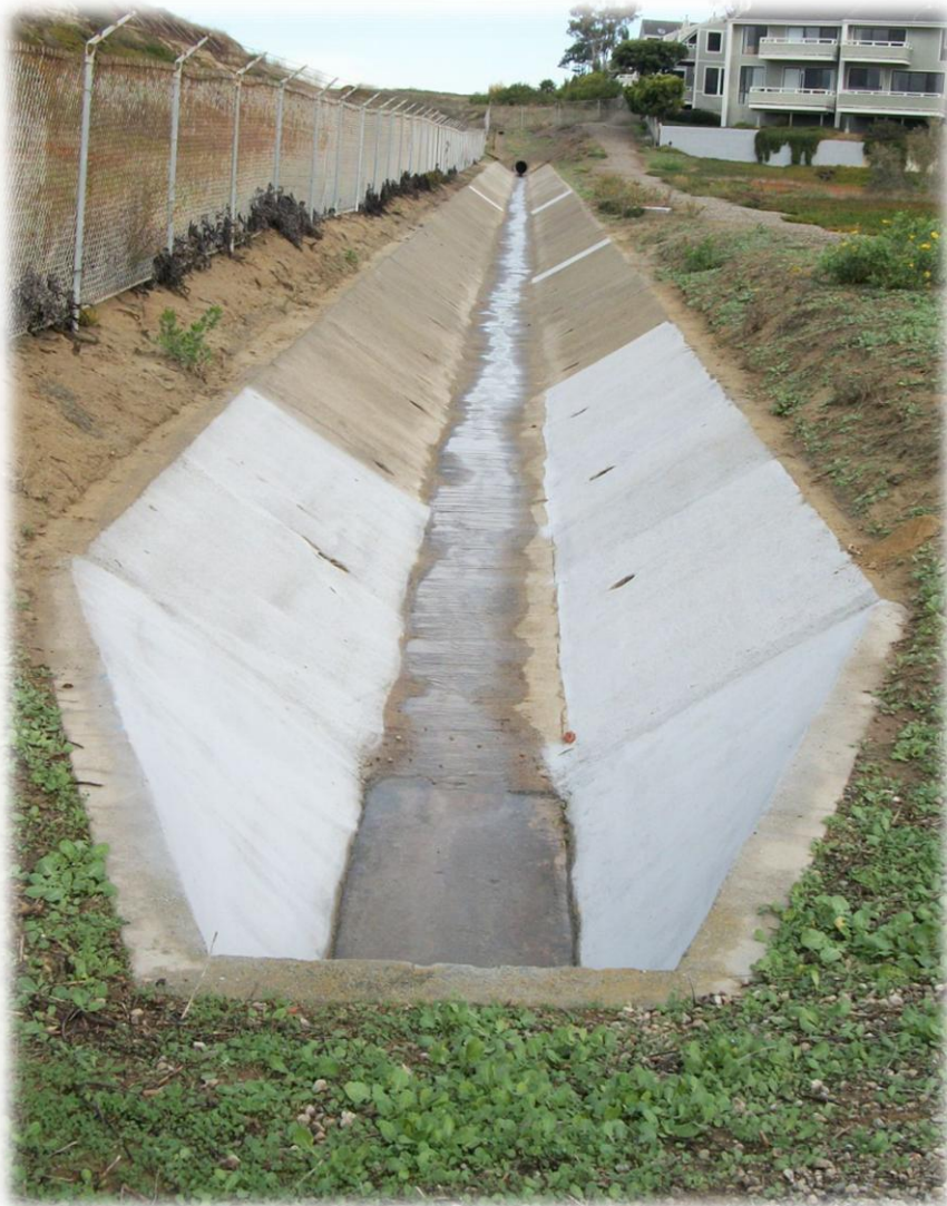
Prior Concrete Trapezoidal Channel