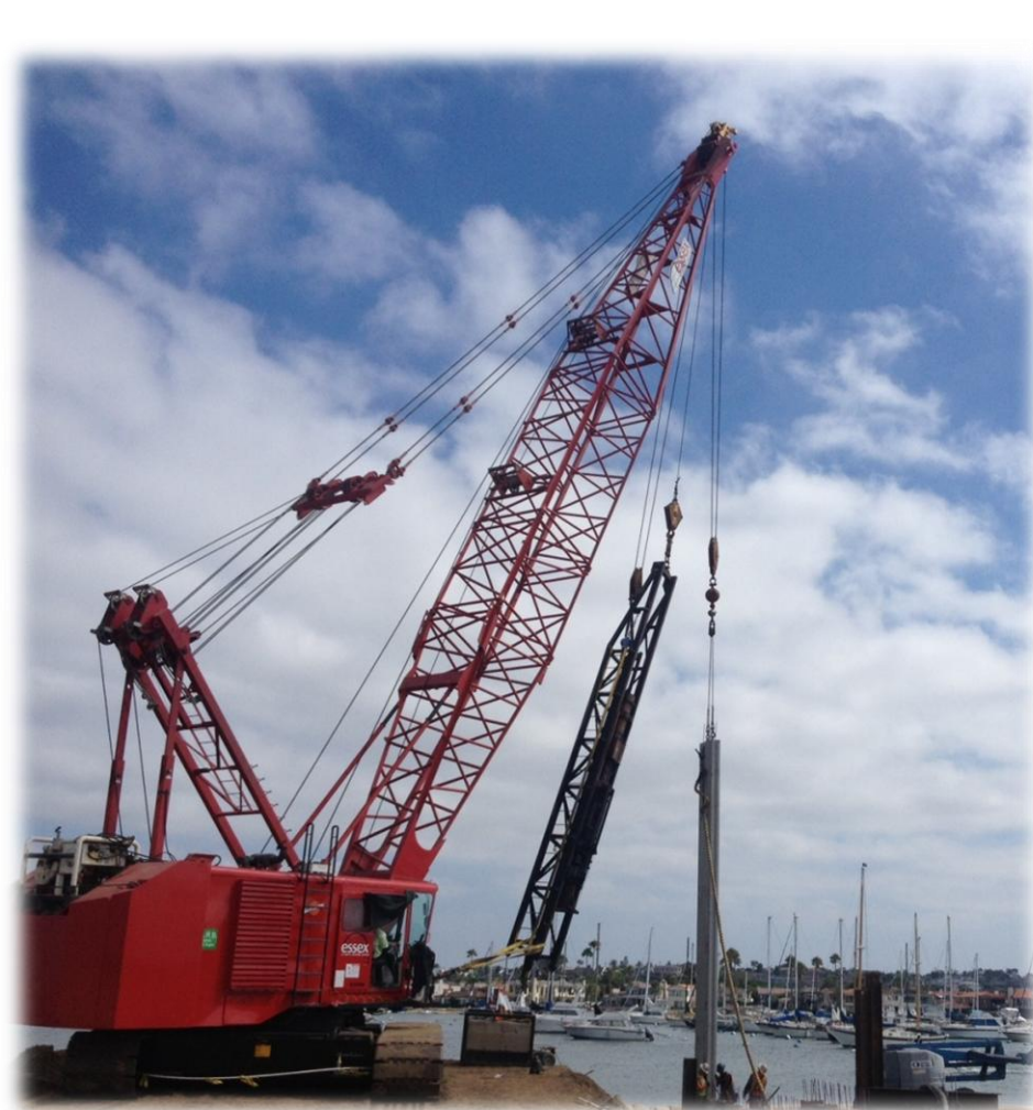
Marina Sheet Pile Installation