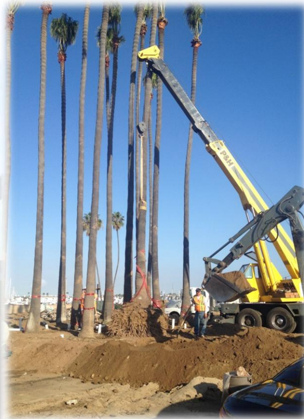
Palm Tree Holding Area