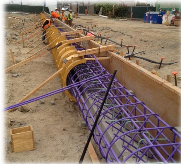
Bulkhead Cap Construction