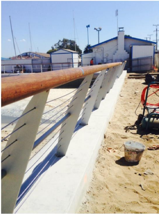
New Marina Handrails