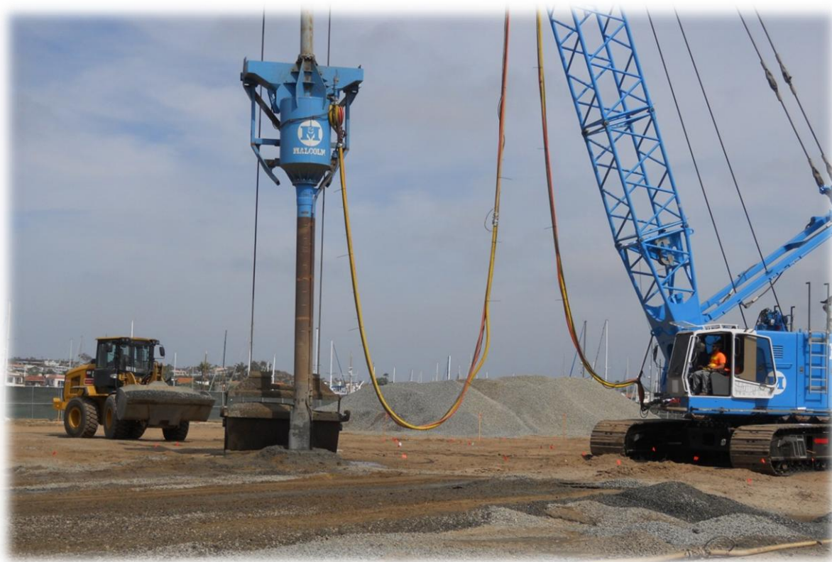
Stone Column Installation