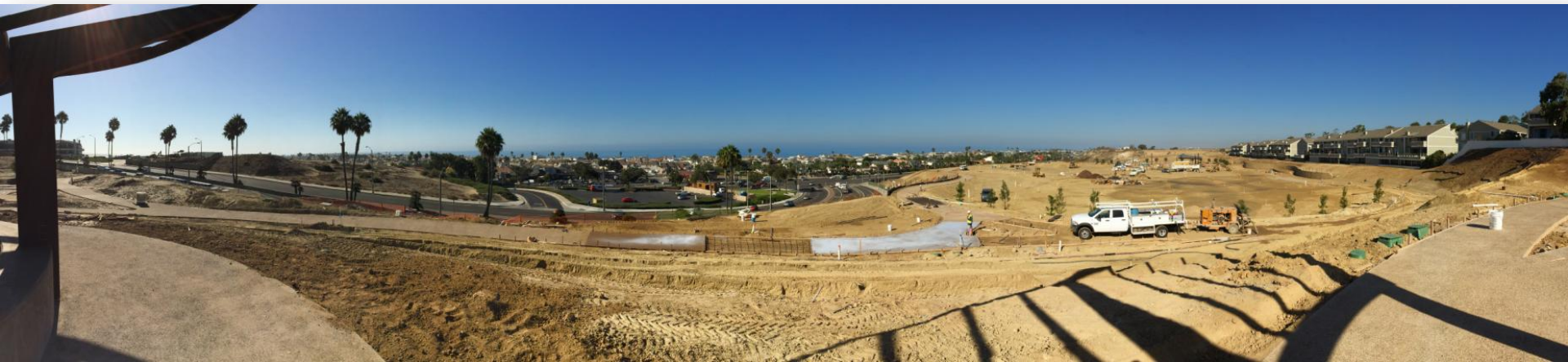
Sunset Ridge Park

Protecting and Providing Quality Public Improvements and Services