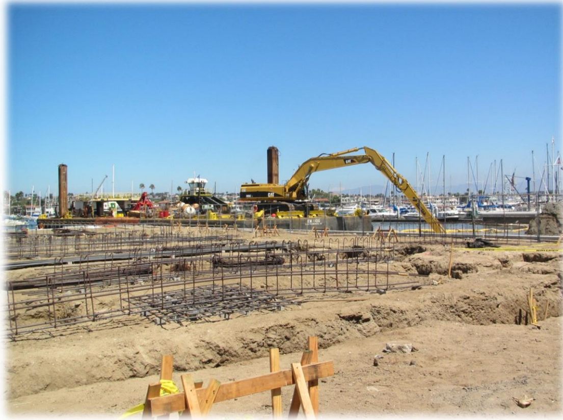
Foundation Reinforcement Steel