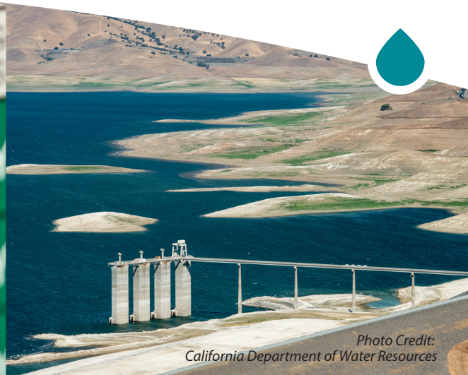
San Luis Reservoir