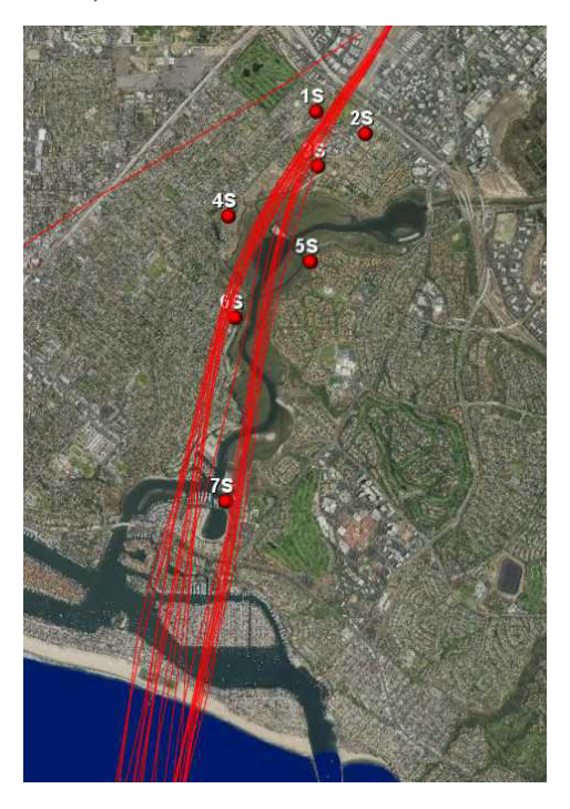
April 27, 2017- After Introduction of HHERO and FINZZ