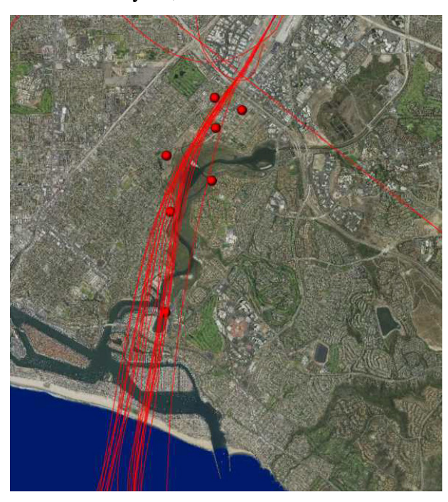
February 27, 2017- Pre Introduction

Below you will find a cursory update of flight tracks after introduction on April 27, 2017 of the HHERO and FINZZ departures, which replaced the MUSEL and CHANNEL, which along with the PIGGN, implemented in March serve as the basis for the departures from JWA. The snapshots are of the first hour of departures on three different days as the changes were introduced.