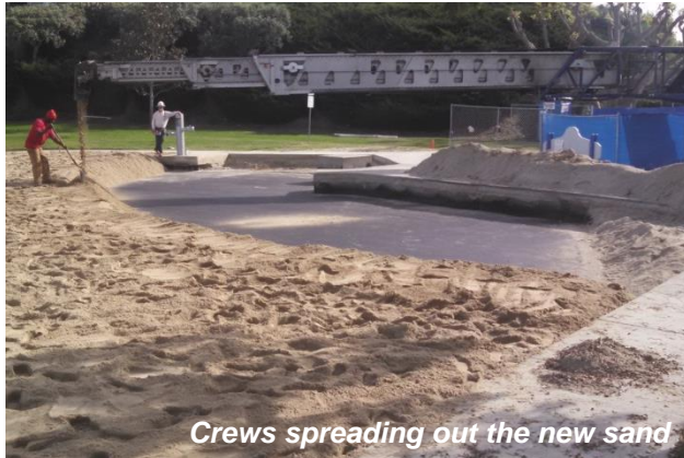
Crews spreading out the new sand

Did you know that there is actually a reservoir underneath Spyglass Park? This underground reservoir was built in the 1970's and serves as a secondary reservoir to the City's Big Canyon Reservoir, which is located just north of the Corona del Mar neighborhood.