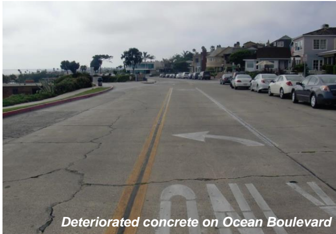
Deteriorated concrete on Ocean Boulevard

The City recently received bids for the Corona del Mar Concrete Street Improvement Project (Phase I). The first phase of this pavement improvement project is located on Ocean Boulevard from Goldenrod Avenue to Marguerite Avenue, and Marguerite Avenue from East Coast Highway to Ocean Boulevard. Proposed improvements consist of removing and reconstructing the existing concrete pavement and deteriorated concrete sidewalks, curbs and driveways, upgrading all curb access ramps to meet current standards, and installing bike racks and a water bottle filling station.