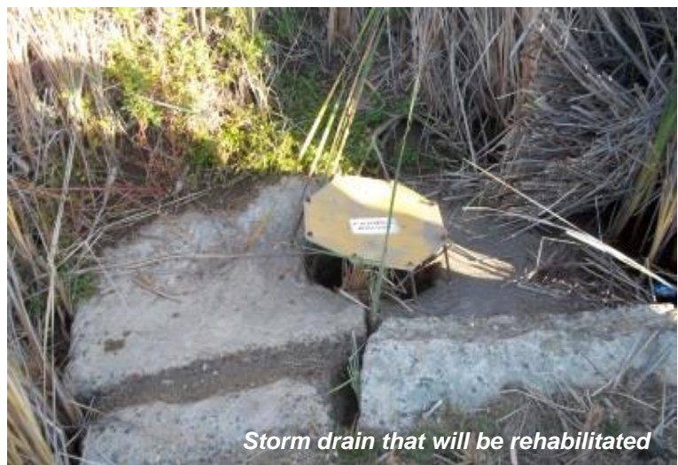
Storm drain that will be rehabilitated

On Monday, December 1, work will begin along Back Bay Drive to rehabilitate several existing storm drain crossings. Many of these storm drains are clogged with sand, rocks, roots, and debris. The contractor will clean, inspect, and reline these storm drains. Rather than removing the drains to perform the work, it will all be completed with the drains in place. By doing the work in place there will be very little interruption to the normal access along Back Bay Drive and visitors will not see any major closures. There will be times during construction that users will need to pay special attention to traffic restrictions. The work along Back Bay Drive is scheduled to be completed in January 2015.