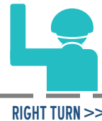
RIGHT TURN >>