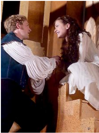
Scene from "Romeo and Juliet"

The City Arts Commission is planning to welcome the troupe of Shakespeare by the Sea to Newport Beach again this summer with free performances for the