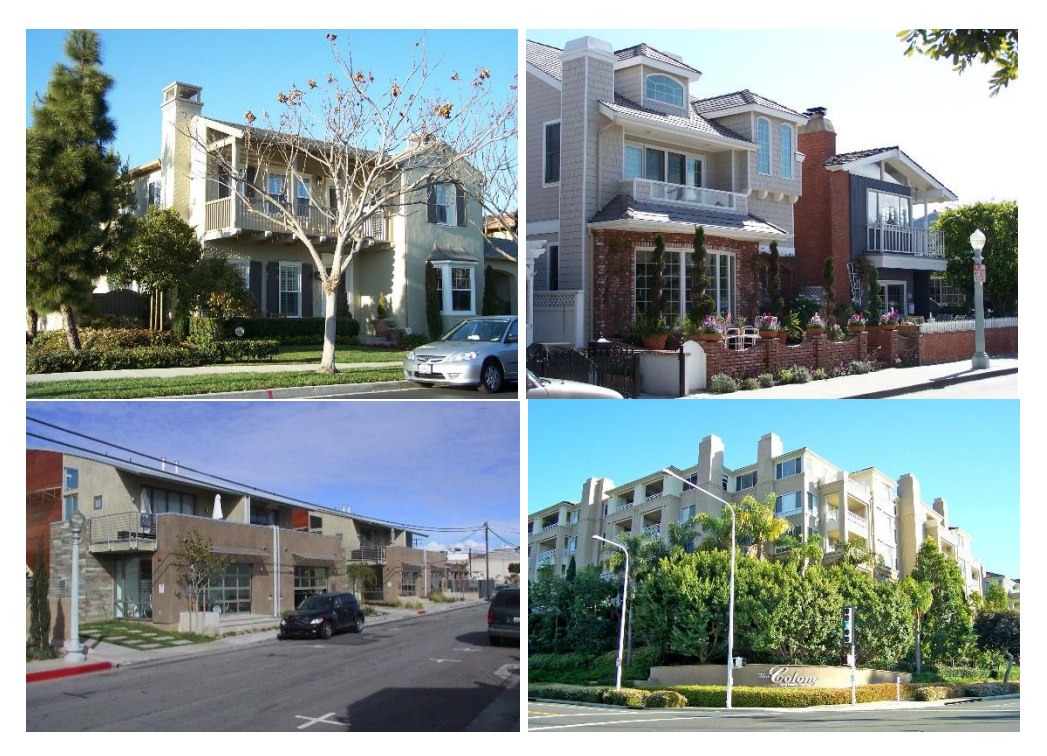
Bonita Canyon, Balboa Island, Cannery Village, and Newport Center residential neighborhoods