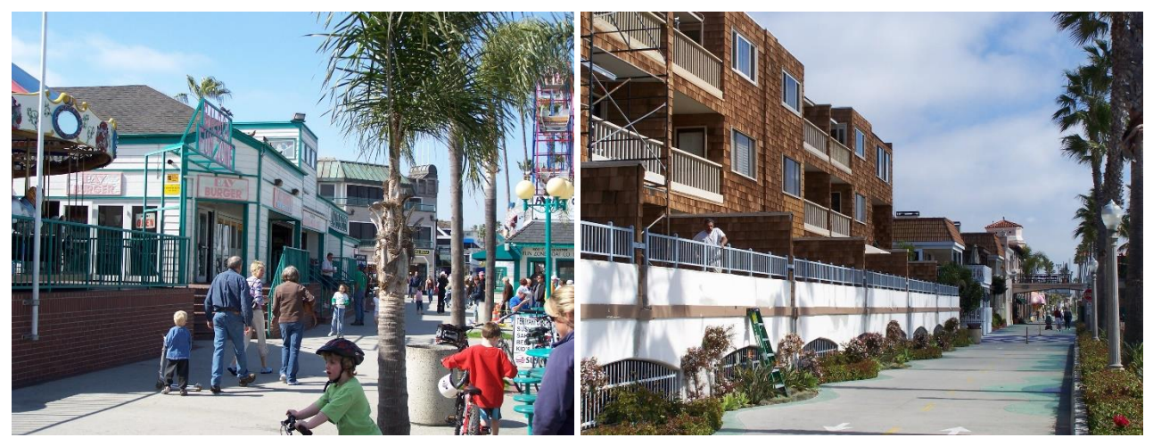
Visitor-serving retail in Balboa Village

Balboa Village and the greater Peninsula have experienced a transition to year-round residential occupancy while the visitor uses have continued. Cumulatively, there is more commercial space than can be supported by local residents, and marginal commercial space is used by businesses that are seasonal and do not thrive throughout the year.