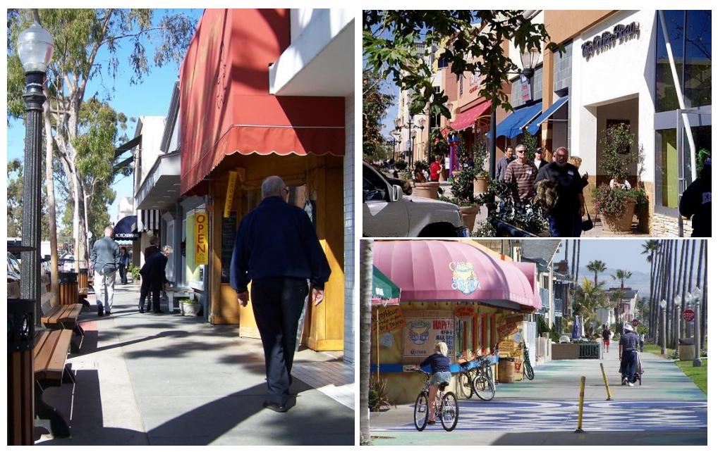
Illustrates pedestrian-oriented characteristics of commercial and mixed-use projects, with transparent and articulated building elevations, wide sidewalks, and streetscape amenities.