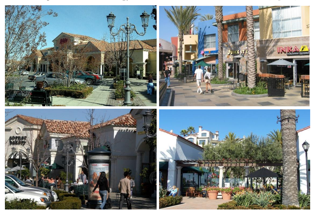
Illustrates pedestrian-activated commercial "village" character with buildings fronting onto wide sidewalks and plazas, outdoor dining, modulation and articulation of building elevations, integrated signage, orientation of storefronts to the pedestrian, and streetscape amenities.