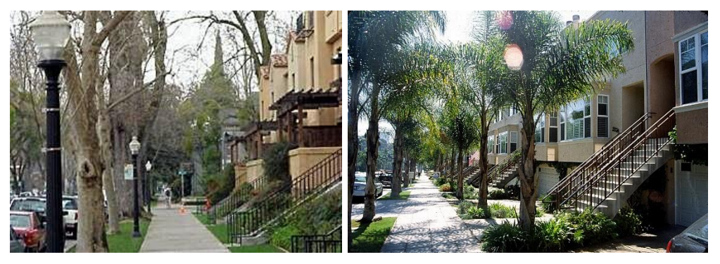
Illustrates pedestrian oriented multi-family residential streets with wide sidewalks, on-street parking, parkways, and units fronting onto streets.

Retain the curb-to-curb dimension of existing streets, but widen sidewalks to provide park strips and generous sidewalks by means of dedications or easements. Except where traffic loads preclude fewer lanes, add parallel parking to calm traffic, buffer pedestrians, and provide short-term parking for visitors and shop customers. ( Imp 3.1, 4.1, 16.1, 20.1 )