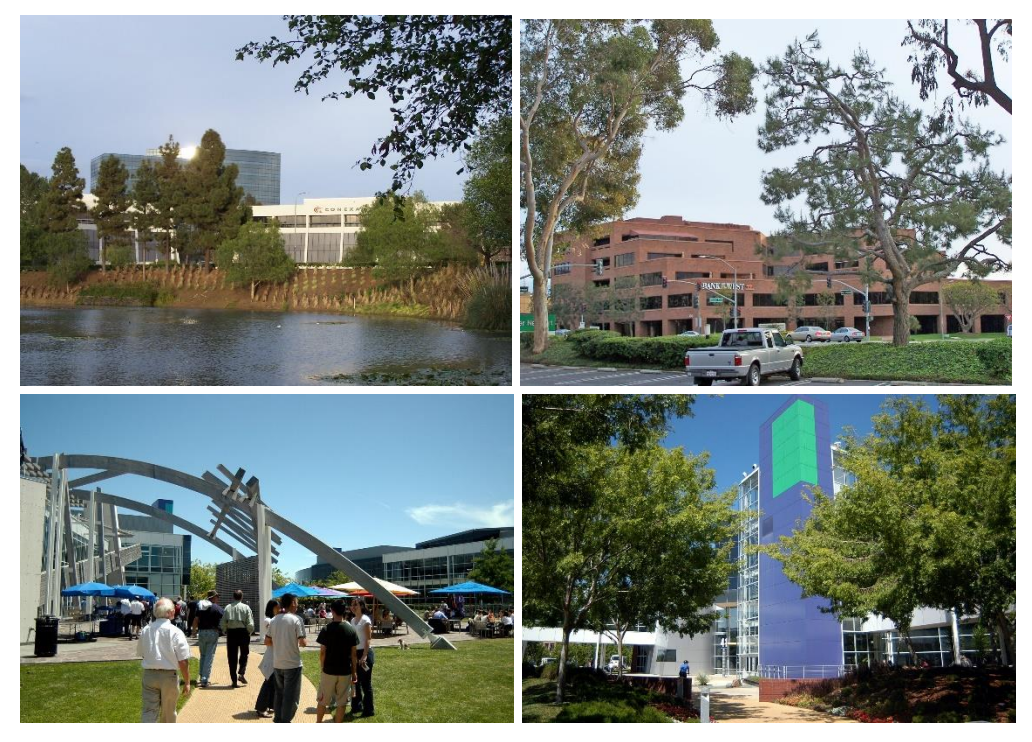
Illustrates massing of industrial and commercial buildings around pedestrian-oriented plazas and open spaces, inclusion of extensive landscape, common signage and streetscapes, and modulation of building volumes and articulation of elevations.