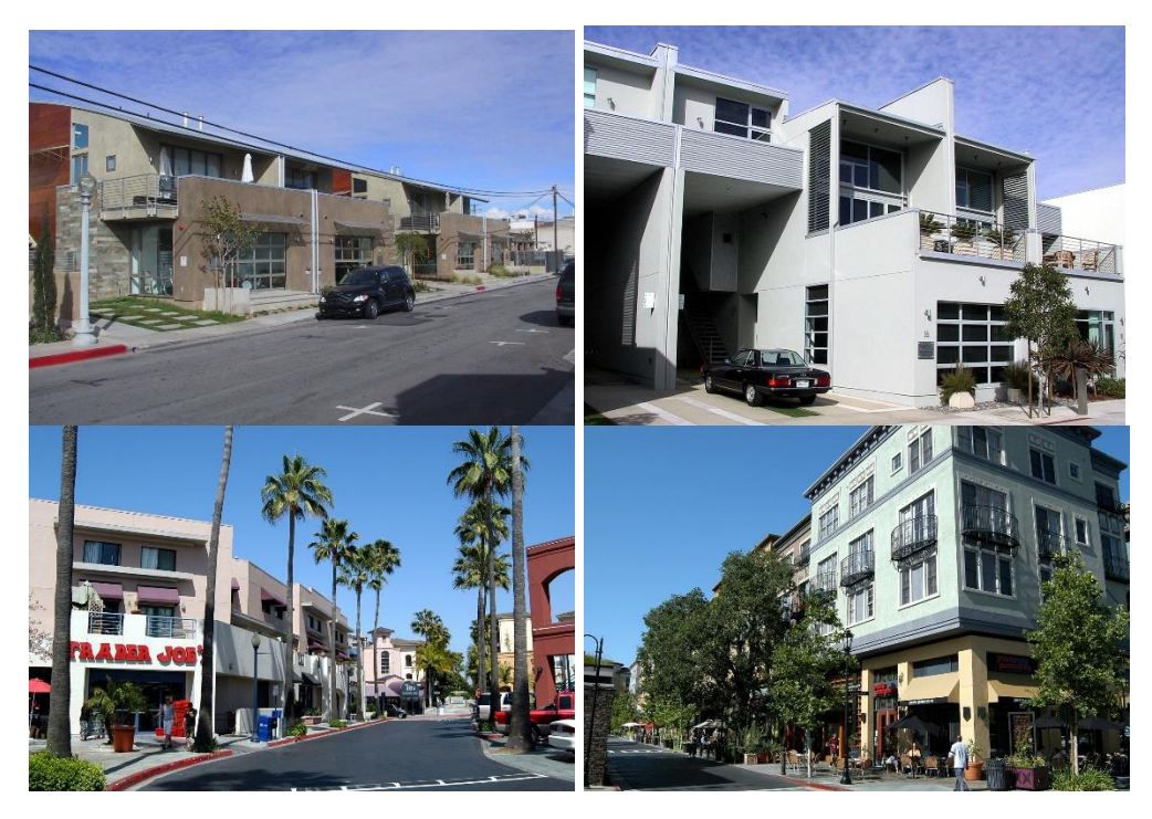
Illustrates mixed-use buildings that integrate ground floor retail and upper floor residential. Modulated building volumes and articulated elevations, separate entries for retail and residential, and orientation of the building to pedestrian-oriented streets.