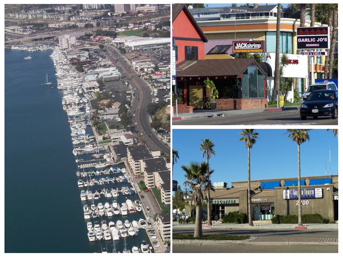
Harbor, retail, and visitor-serving uses in Mariners' Mile

Mariners' Mile is a heavily traveled segment of Coast Highway extending from the Arches Bridge on the west to Dover Drive on the east. It is developed with a mix of highway-oriented retail and marine-related commercial uses. The latter are primarily concentrated on bay-fronting properties and include boat sales and storage, sailing schools, marinas, visitor-serving restaurants, and comparable uses. A large site is developed with the Balboa Bay Club and Resort, a hotel, private club, and apartments located on City tidelands. A number of properties contain nonmarine commercial uses, offices, and a multi-story residential building.