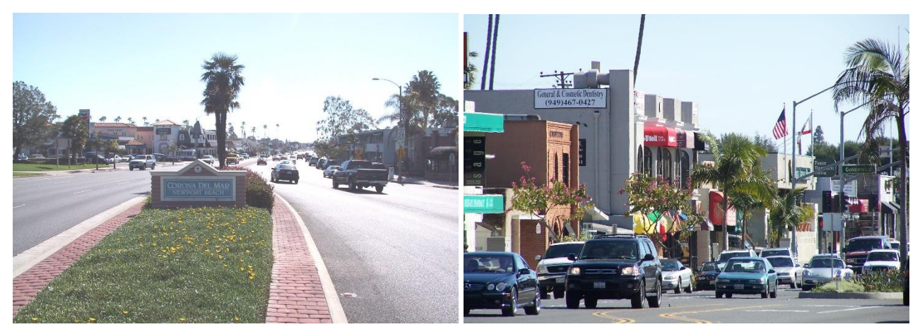
Views of Corona del Mar along Pacific Coast Highway

Buildings in the Corona del Mar corridor mostly front directly on and visually open to the sidewalks, with few driveways or parking lots to break the continuity of the "building wall" along the street. These, coupled with improved streetscape amenities, landscaped medians, and a limited number of signalized crosswalks, promote a high level of pedestrian activity.