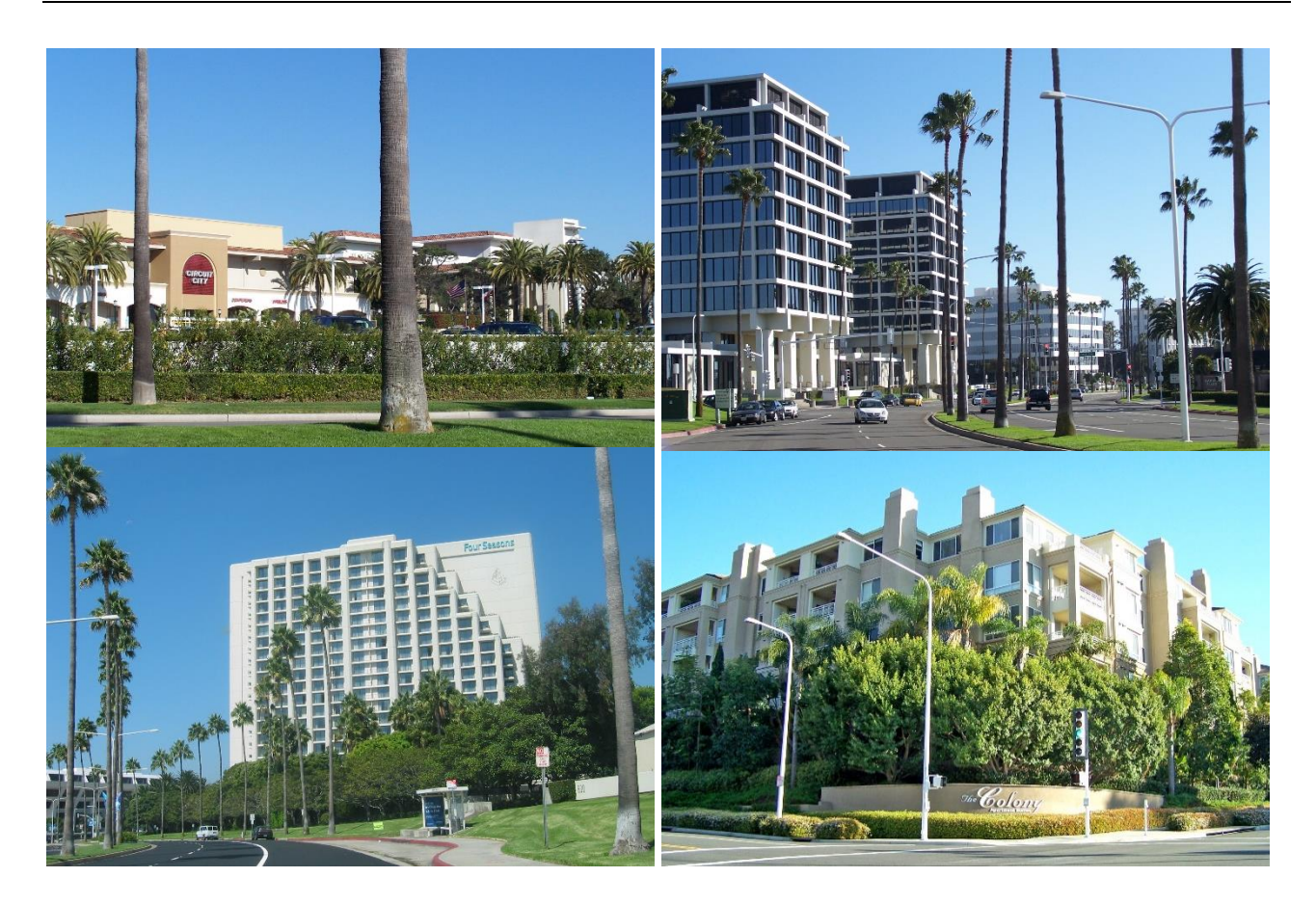
Newport Center commercial, office, hotel, and residential

While master planned, the principal districts of Newport Center/Fashion Island are separated from one another by the primary arterial corridors. Fashion Island is developed around an internal pedestrian network and surrounded by parking lots, providing little or no connectivity to adjoining office, entertainment, or residential areas. The latter also contain internal pedestrian circulation networks surrounded by parking and are disconnected from adjoining districts.