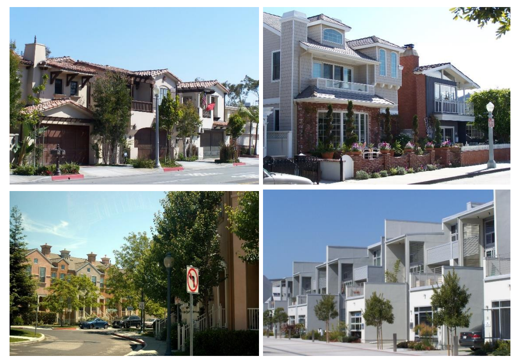
Illustrates multi-family residential infill townhomes, rowhouses, and apartments. Modulation of building volume and heights, articulated elevations, and orientation of residential units to the street.