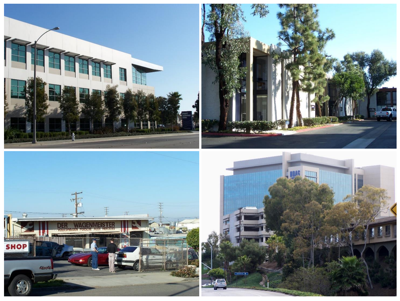
Office and commercial buildings in West Newport Mesa

the Westside Costa Mesa area to the north. A number of Newport Beach's marine-related businesses have relocated to the area over recent decades as coastal land values have escalated. Most of the properties are developed for single business tenants and have little landscape or architectural treatment, typical of older industrial districts of Southern California.