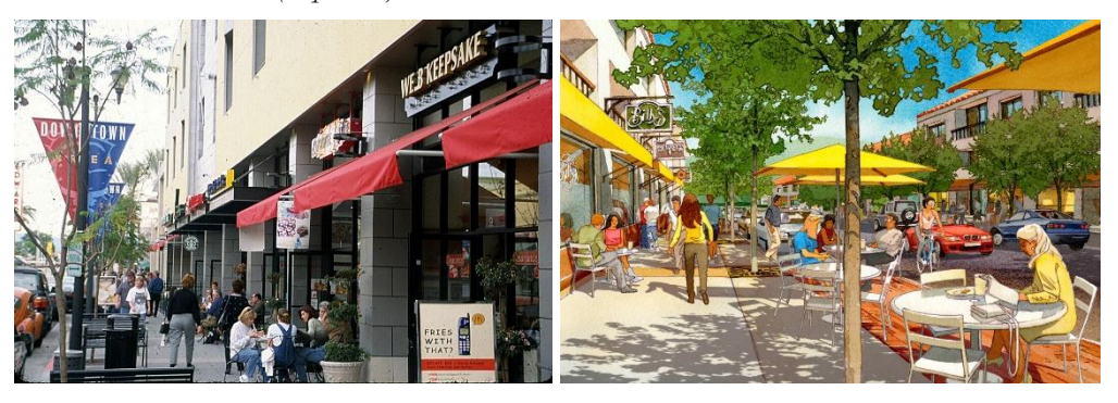
Illustrates streetscape amenities including wide sidewalks, trees providing shade for pedestrians, benches and outdoor seating, and pedestrian-scaled signage and lighting.

Develop a plan and work with property owners and businesses to fund and implement streetscape improvements that improve Balboa Peninsula's visual quality, image, and pedestrian character. This should include well-defined linkages among individual districts, between the ocean and Bay, and along the Bay frontage, as well as streetscape and entry improvements that differentiate the character of individual districts. (Imp 20.1)