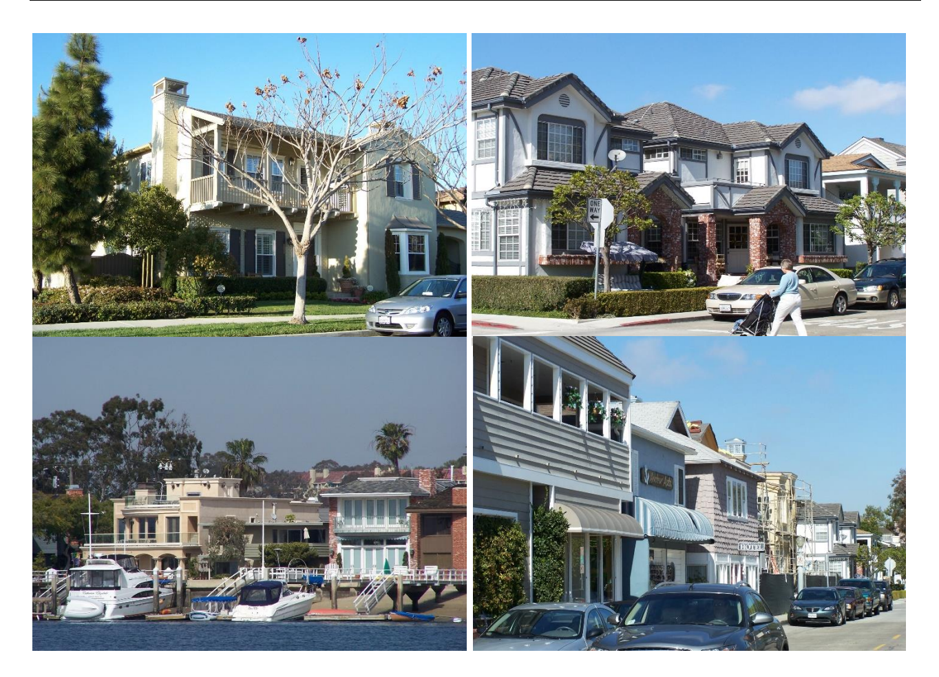
Newport Beach includes a variety of residential neighborhoods

As the community has approached build-out, little vacant land remains. New development has focused on nontraditional sites such as infill and mixed-use development on smaller vacant and underutilized sites in or near commercial areas.