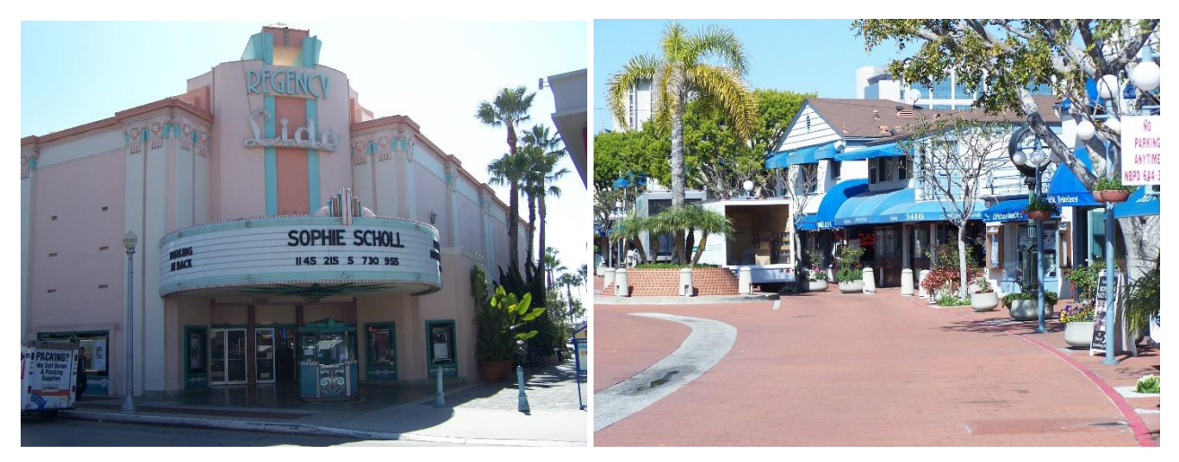
Movie theater in Lido Village

Lido Village has a unique location at the turning basin in Newport Harbor. The channel is wider than in other locations, providing an opportunity for waterfront commercial uses that will not negatively impact residential uses across the channel.