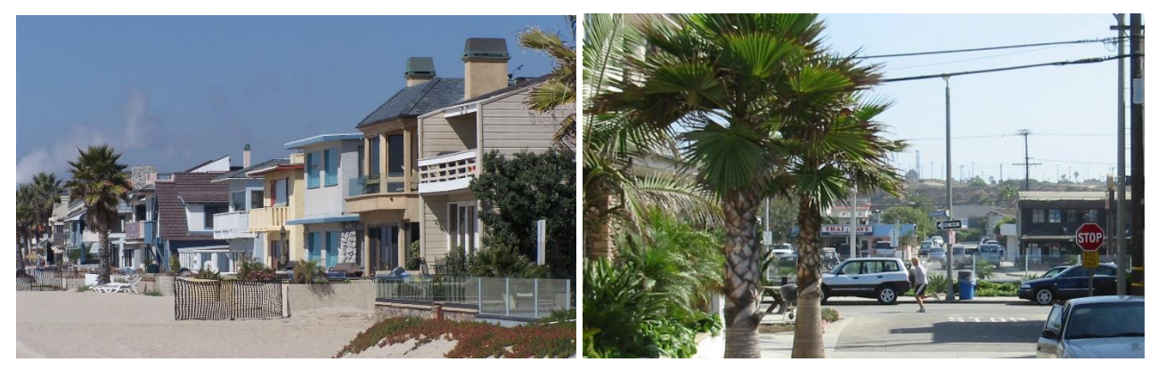
Residential in West Newport

This area is regulated by an adopted Specific Plan, which was intended to promote its orderly development and provide service commercial uses for nearby residences.