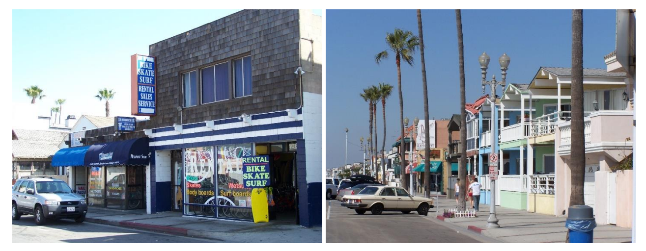
Retail use in McFadden Square

Commercial land uses are largely concentrated in the strips along Balboa and Newport Boulevards, with residential along the ocean front and marine-related uses fronting the harbor. Numerous visitor-serving uses include restaurants, beach hotels, tourist-oriented shops (t-shirt shops, bike rentals, and surf shops), as well as service operations and facilities that serve the Peninsula. There are several bars in the area with some featuring live music, especially along the ocean front. Historically, the area has been known for its marine-related industries such as shipbuilding and repair facilities and boat storage on the harbor, some of which have been in continuous operation for over fifty years. Public parking is available in three lots, which primarily serve the beach users, tourists, and the restaurant patrons.