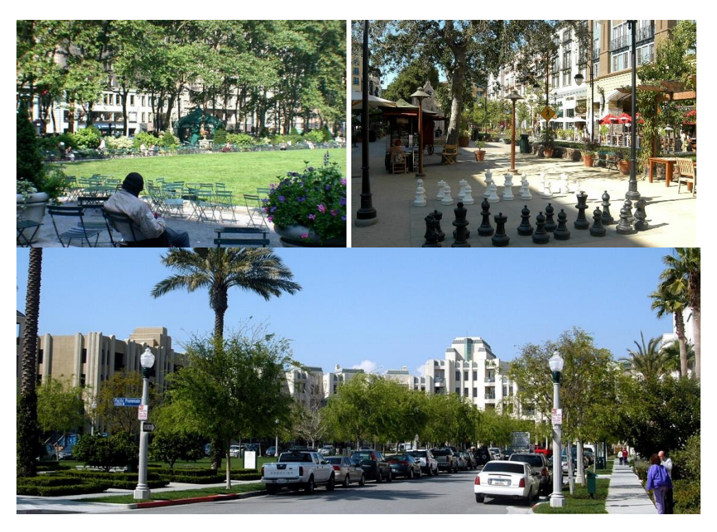
Illustrates integration of public parks in high density residential developments. Parks are surrounded by streets and incorporate a diversity of active and passive recreational facilities