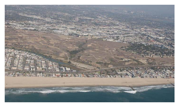
Aerial view of the Banning Ranch area

western edge of Newport Mesa that slopes gently from east to west. Bluffs form the western edge of the mesa, and are located in the central portion of the Banning Ranch area. The western portion of the site, which is lower in elevation, historically contained a tidal marsh associated with the Semeniuk Slough and Santa Ana River.