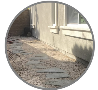
12. Immediate Zone