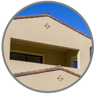
6. Exterior Siding