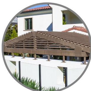
10. Patio Covers