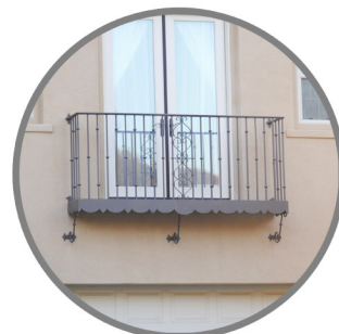
11. Balconies & Decks