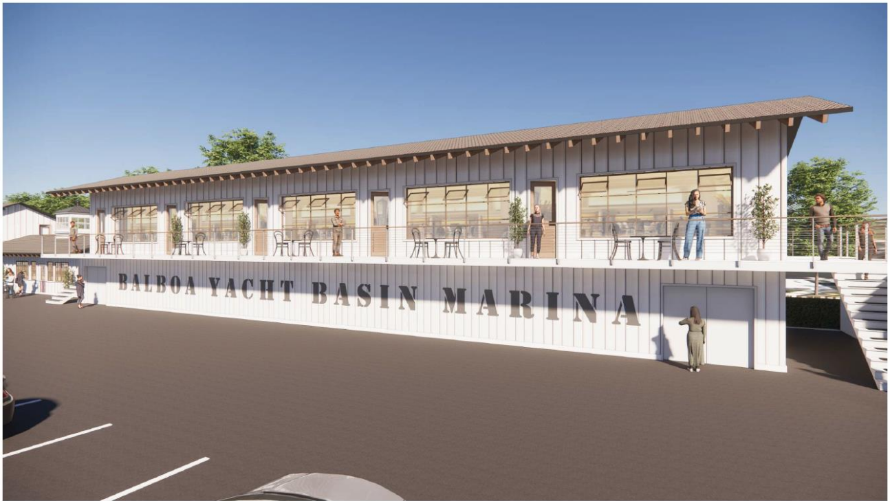
BALBOA YACHT BASIN Newport Beach, California