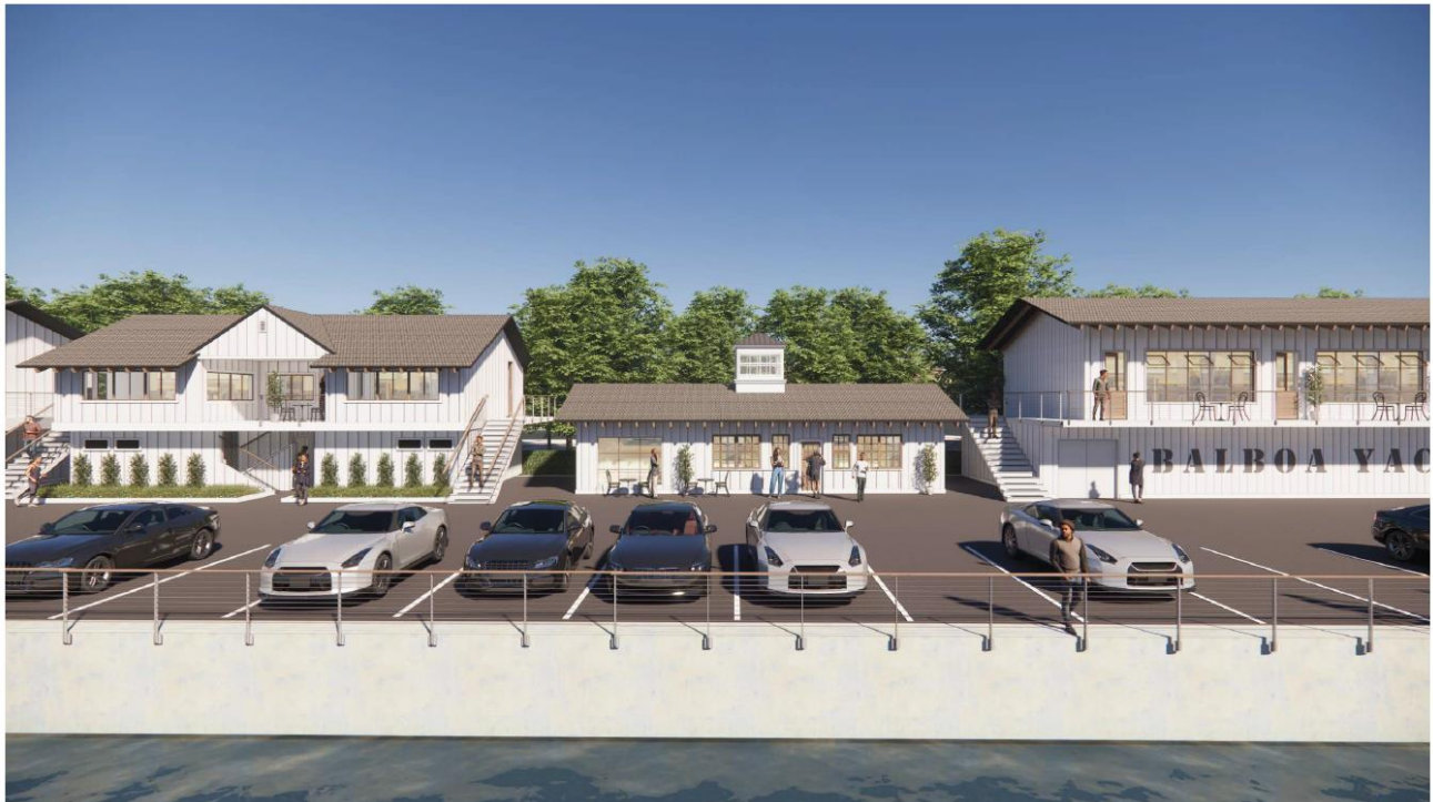
BALBOA YACHT BASIN Newport Beach, California