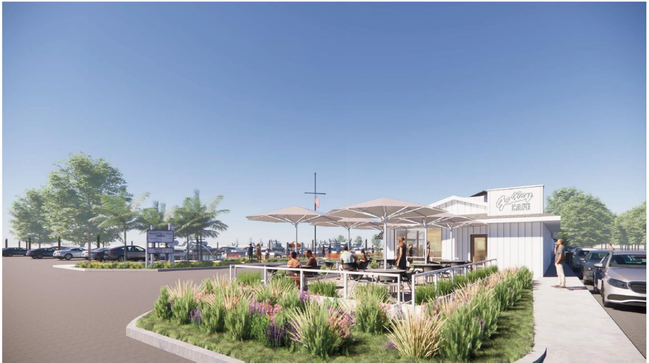
BALBOA YACHT BASIN Newport Beach, California