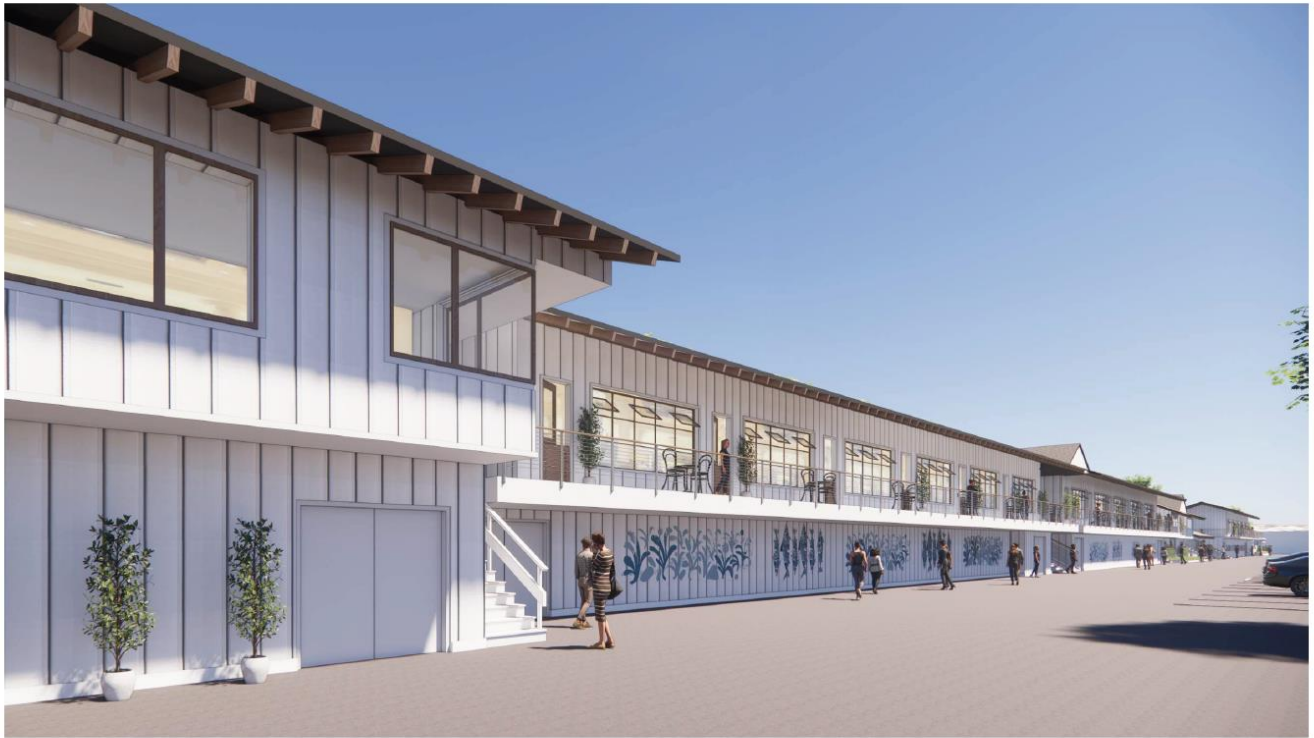
BALBOA YACHT BASIN Newport Beach, California