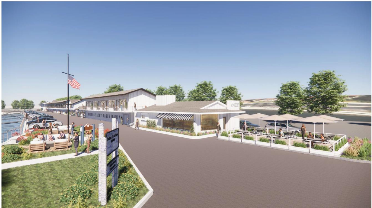
BALBOA YACHT BASIN Newport Beach, California