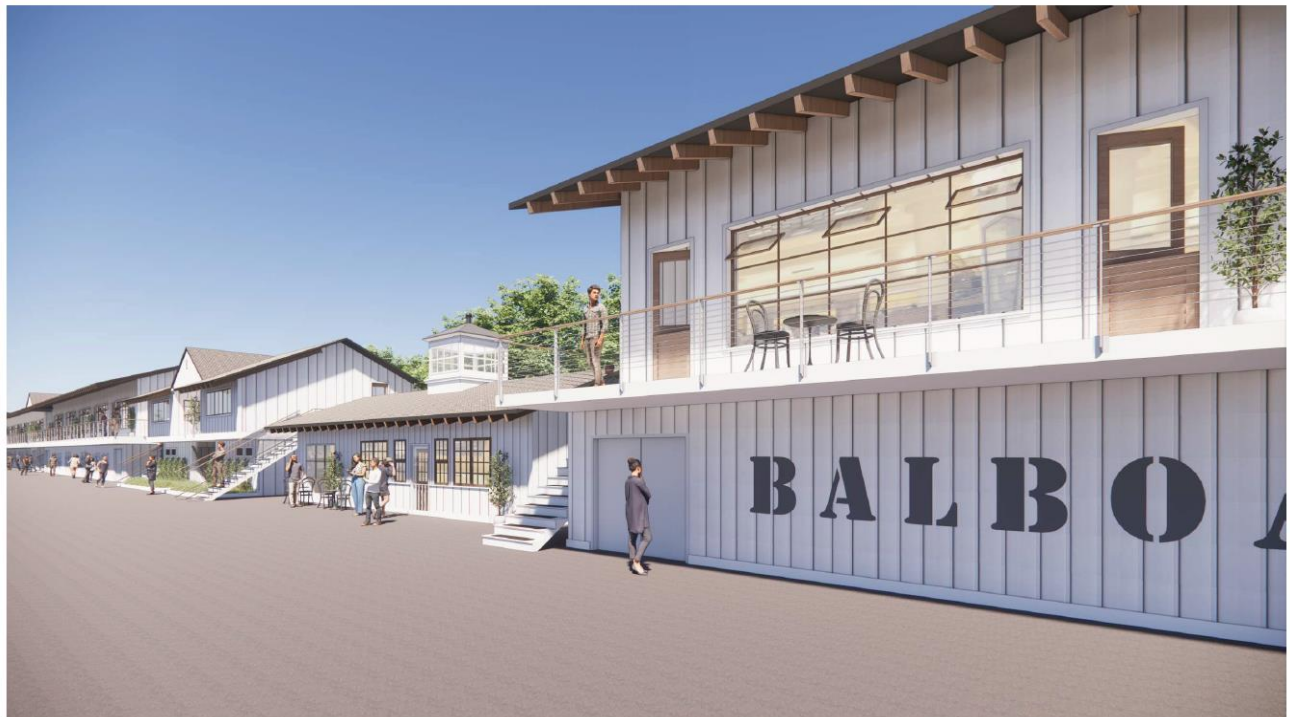
BALBOA YACHT BASIN Newport Beach, California