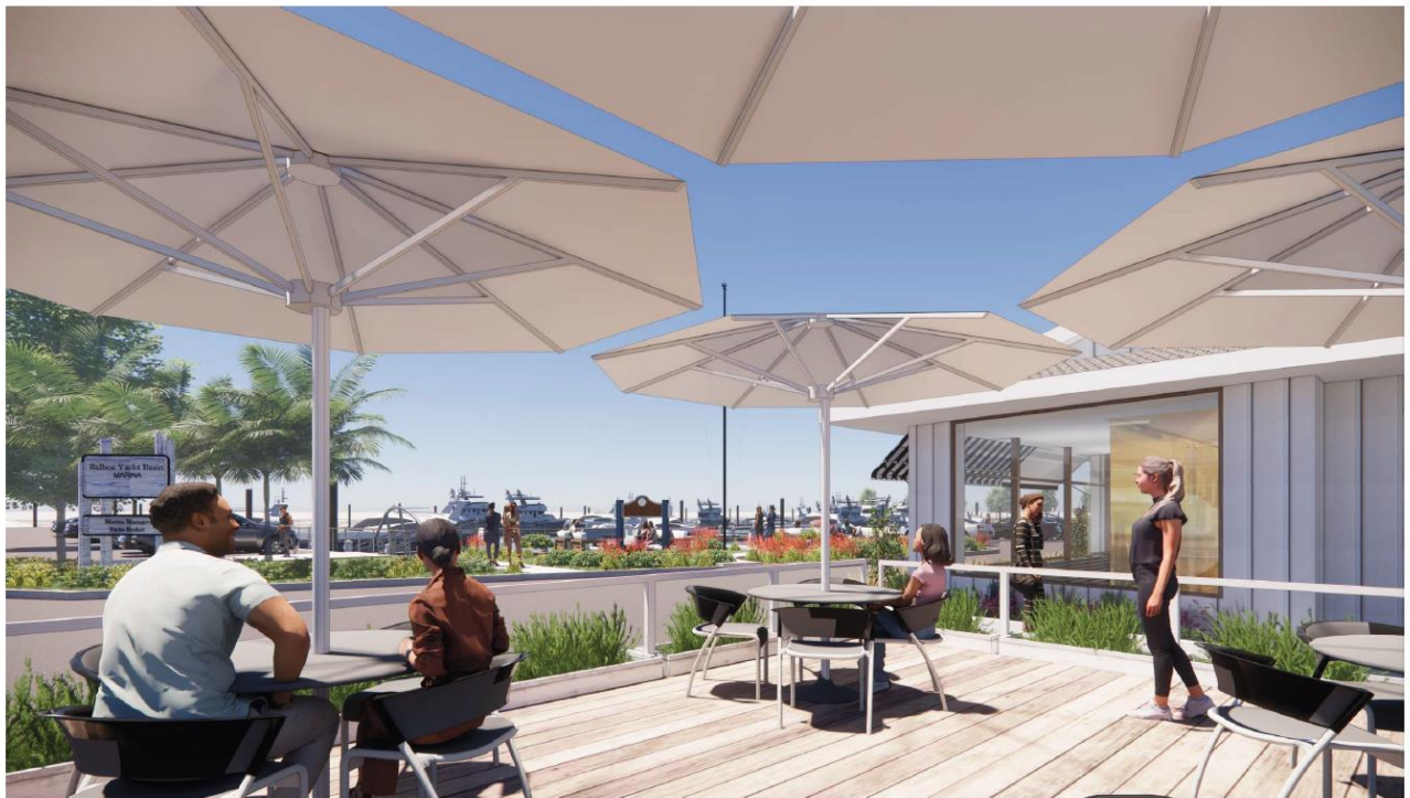
BALBOA YACHT BASIN Newport Beach, California