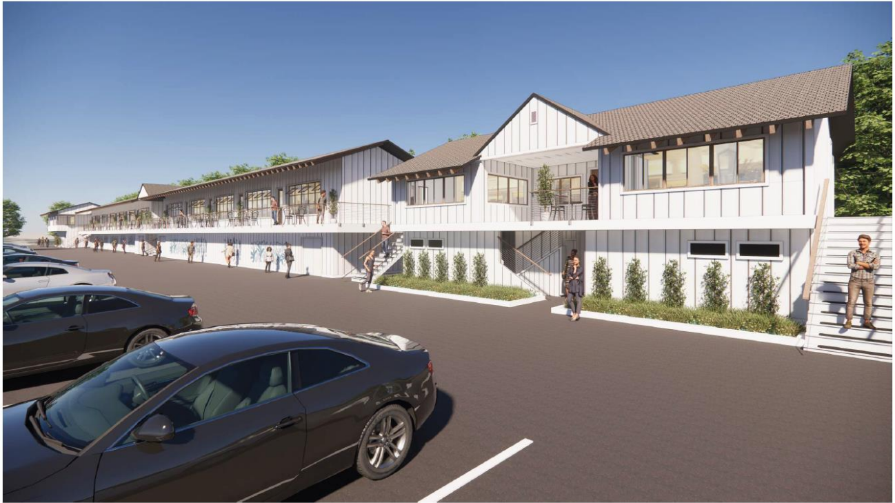
BALBOA YACHT BASIN Newport Beach, California