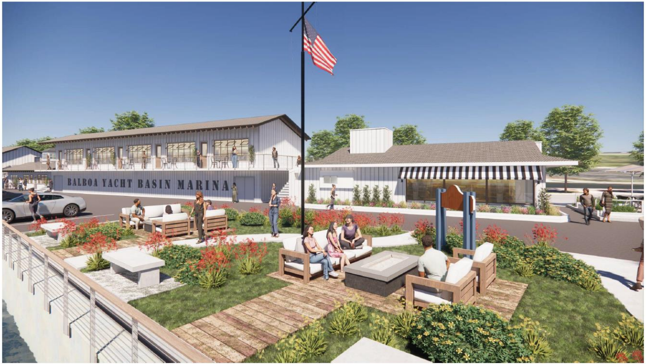
BALBOA YACHT BASIN Newport Beach, California