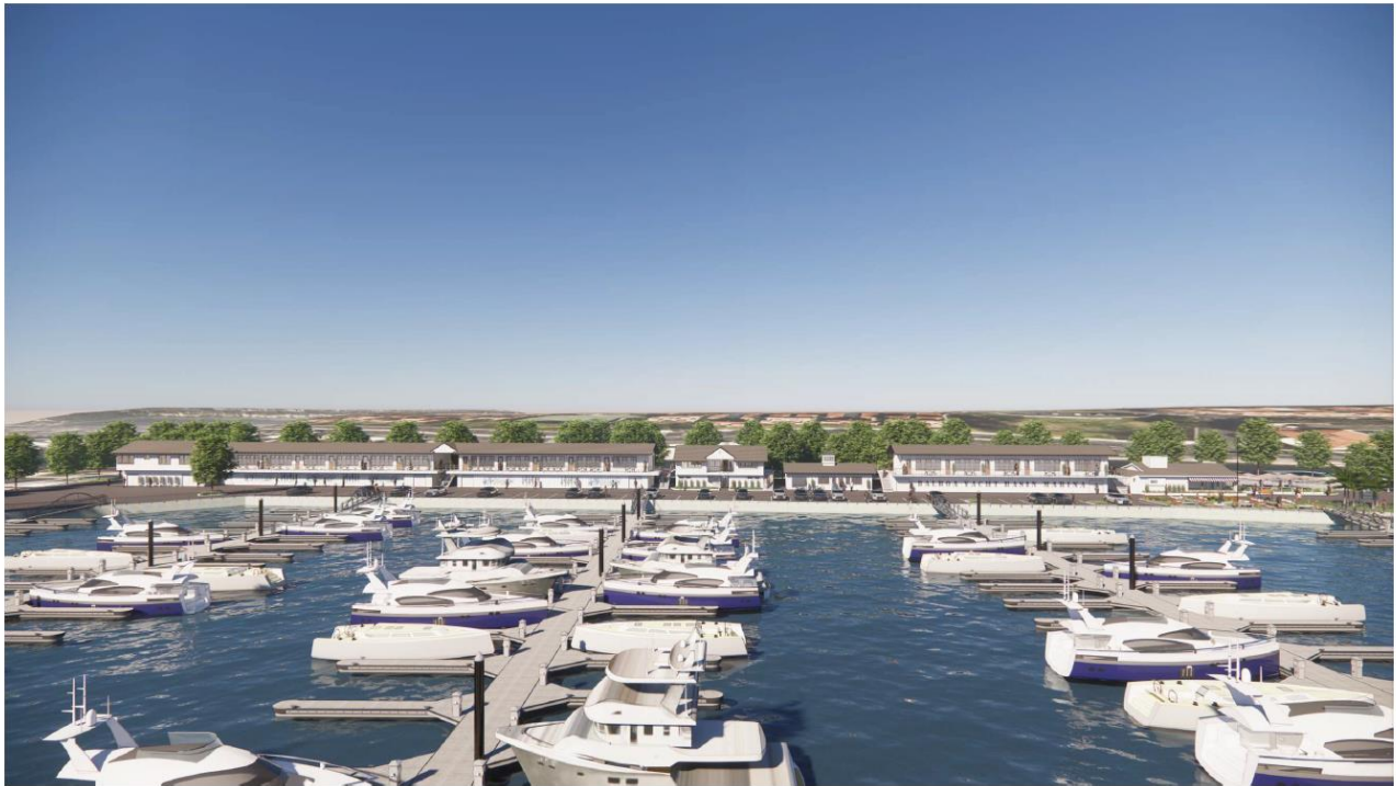
BALBOA YACHT BASIN Newport Beach, California