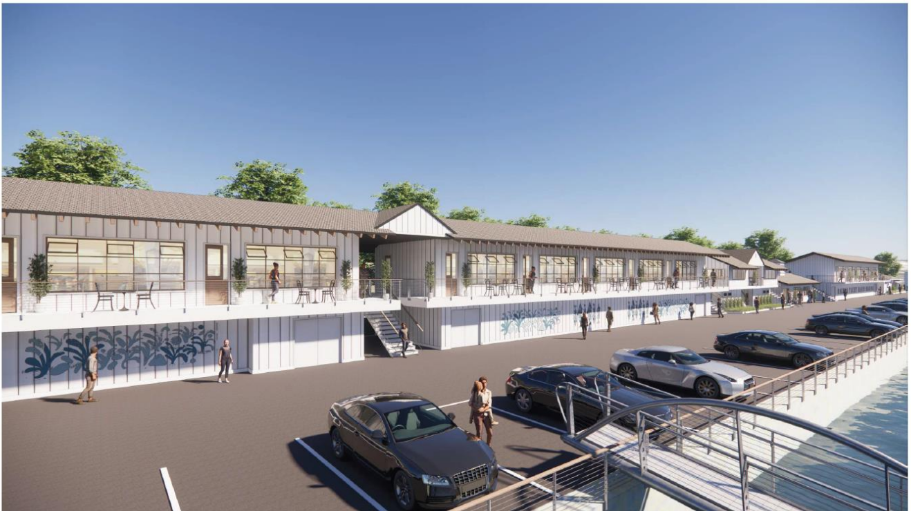
BALBOA YACHT BASIN Newport Beach, California