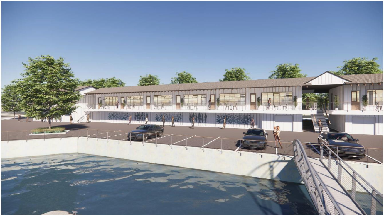
BALBOA YACHT BASIN Newport Beach, California