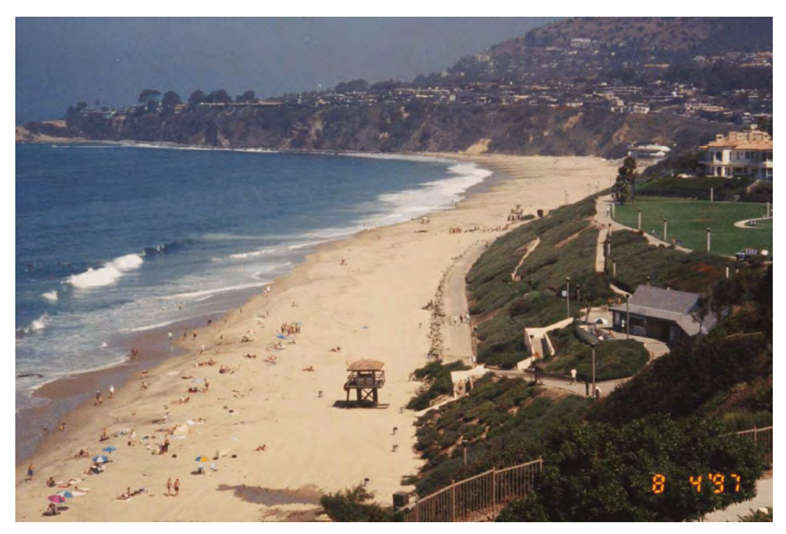
Figure 6. Recreationists at Salt Creek Beach, California (photo by Ruth Pratt, with permission).