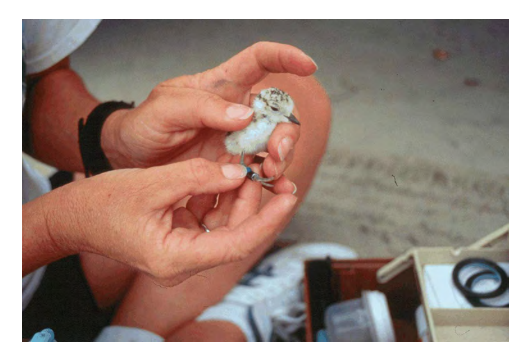
Figure 10. Banding a western snowy plover chick