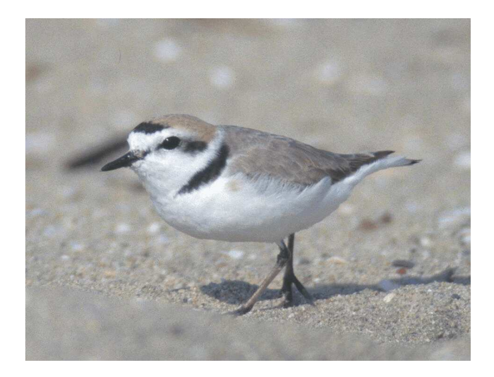
Figure 2. Adult male westem snowy plover.

The species was first described in 1758 by Linnaeus (American Ornithologists' Union 1957). Two subspecies of the snowy plover have been recognized in North America (American Ornithologists' Union 1957): the western snowy plover (Charadrius alexandrinus nivosus) and the Cuban snowy plover (C. a. tenuirostris). The Pacific coast population of the western snowy plover breeds on the Pacific coast from southern Washington to southern Baja California, Mexico. Wintering birds may remain at their breeding sites or move north or south to other wintering sites along the Pacific coast. The interior population of the western snowy plover breeds in interior areas of Oregon, California, Nevada, Utah, New Mexico, Colorado, Kansas, Oklahoma, and north-central Texas, as well as coastal areas of extreme southern Texas, and possibly extreme northeastern Mexico (American Ornithologists' Union 1957). Although previously observed only as a migrant in Arizona, small numbers have bred there in recent years (Monson and Phillips 1981, Davis and Russell 1984). Interior population birds breeding east of the Rockies generally winter along the Gulf coast, while most interior population birds breeding west of the Rockies winter in coastal California and Baja