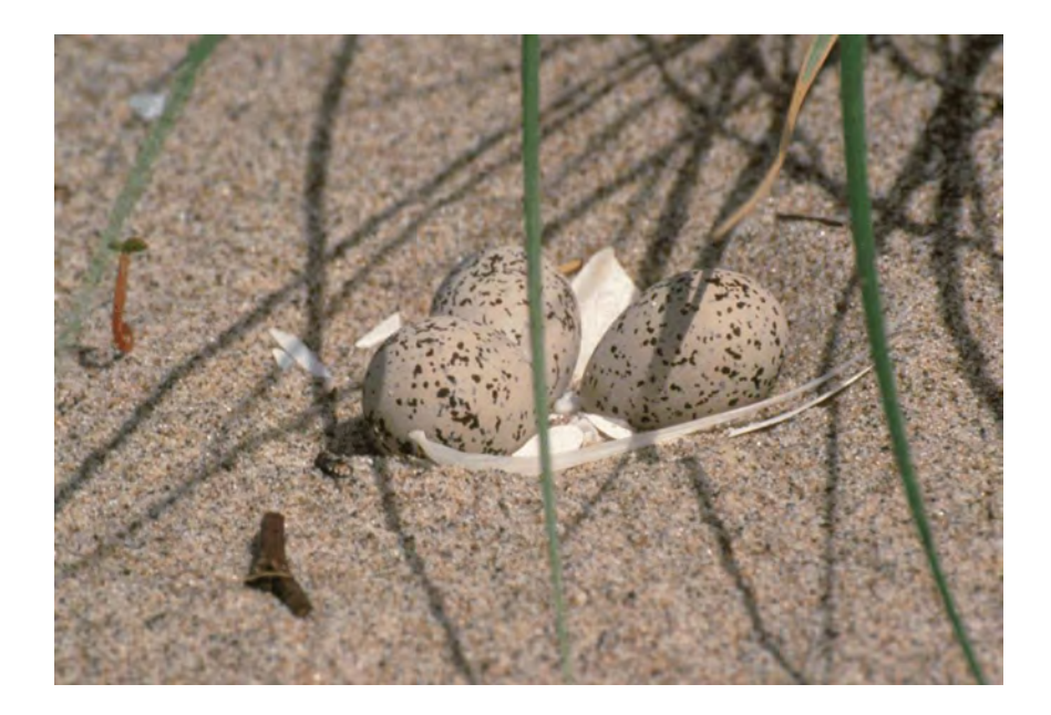
Figure 4. Western snowy plover clutch.

incubation of completed clutches. More typical, however, is for the incubating adult to run away from the eggs without being seen. Incomplete clutches are those in which all eggs have not been laid. Partly-incubated clutches are those clutches having some degree (in days) of incubation.