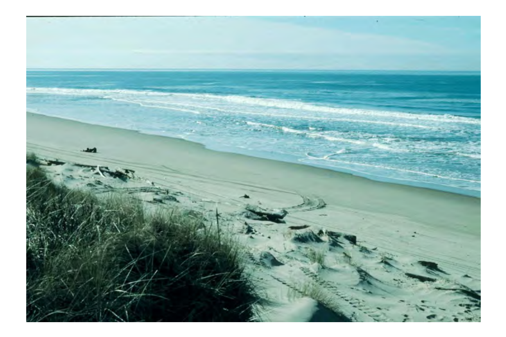
Figure 3. Coastal beach in Oregon Dunes National Recreational Area

unconsolidated soils, high winds, storms, wave action, and colonization by plants. Less common nesting habitats include bluff-backed beaches, dredged material disposal sites, salt pond levees, dry salt ponds, and river bars (Wilson 1980, Page and Stenzel 1981, Powell et al. 1996, Tuttle et al. 1997).