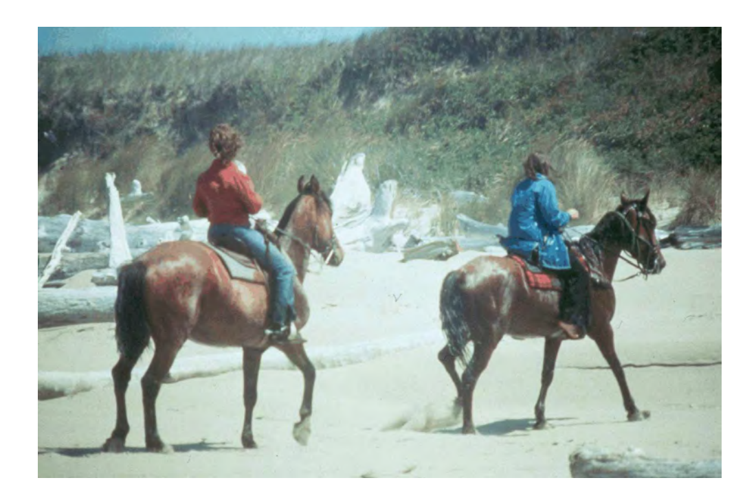
Figure 7. Equestrians on beach.