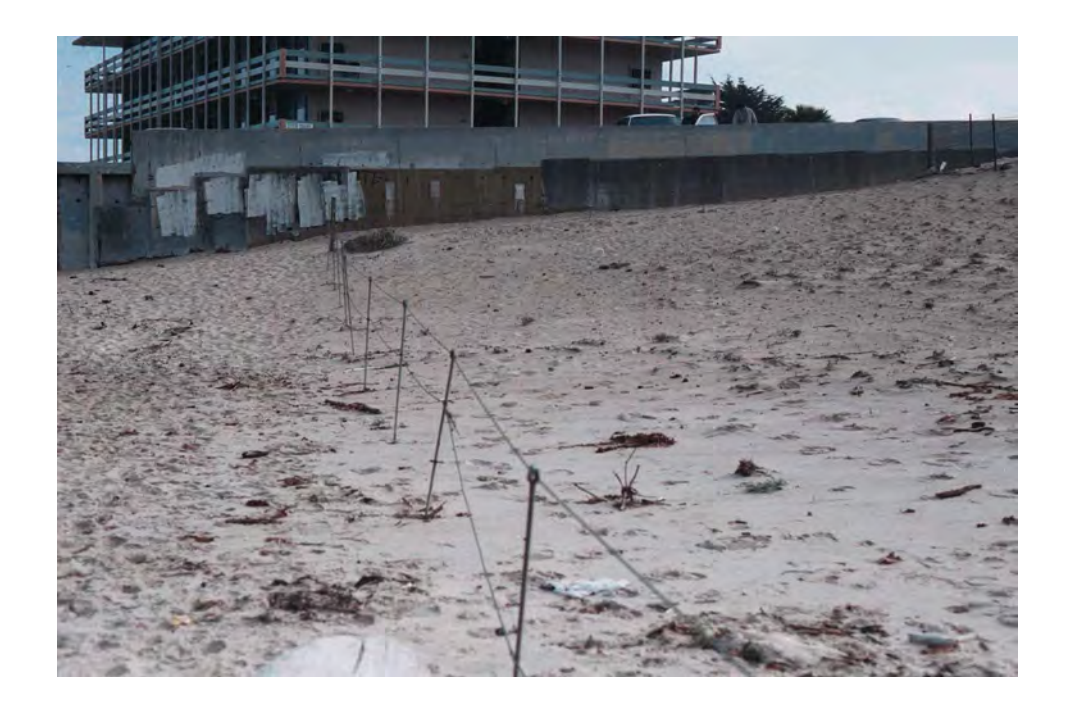
Figure 9. Symbolic fencing on beach at Monterey Bay, California.

light-weight cord or cable strung between posts to delineate areas where humans ( e.g. , pedestrians and vehicles) should not enter (Figure 9). It is placed around areas where there are nests or unfledged chicks, and is intended to prevent accidental crushing of eggs, flushing of incubating adults, and, if large enough, to provide an area where chicks can rest and seek shelter when large numbers of people are on the beach. Directional signs (regarding closed areas, nesting sites, etc.) also are used within western snowy plover habitats and near protective fencing to alert the public and other beach users of the sensitivity of western snowy plover nesting and wintering areas. Installation of symbolic fencing at Coal Oil Point Reserve (CA-88) in conjunction with a docent program has allowed management of