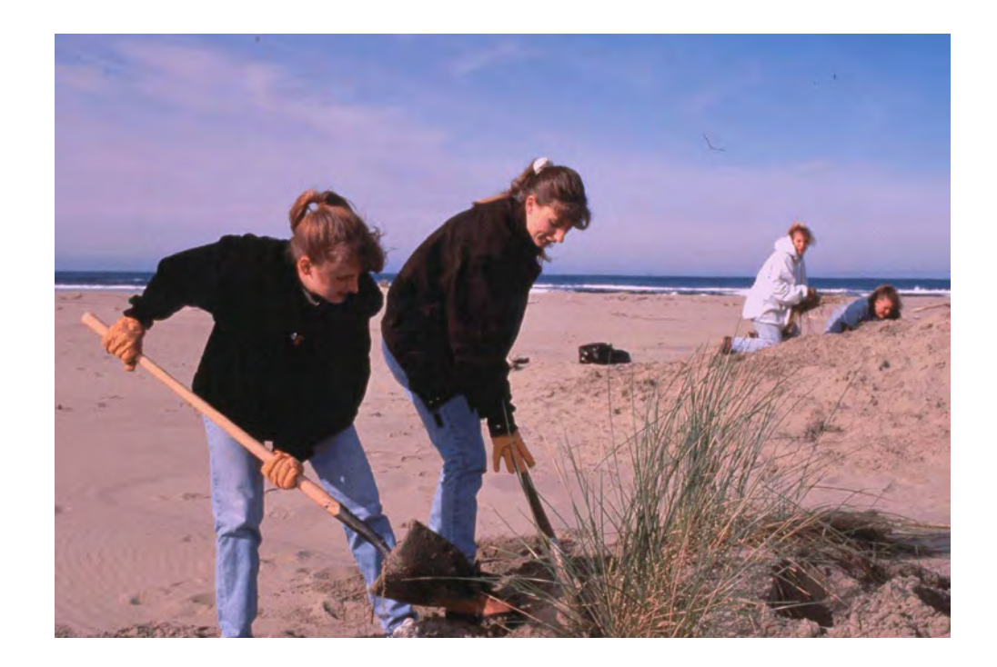
Figure 11. High school students removing European beachgrass.

Recreation Area, Point Reyes National Seashore, and Golden Gate National Recreation Area. Volunteers and docents assist public land managers in many ways (Appendix K), including informing park visitors about threats to the western snowy plover, reducing human and pet disturbances, and assisting with direct habitat enhancement ( e.g. , manual removal of European beachgrass; Figure 11). In 1998, the Western Snowy Plover Guardian Program was developed to assist the conservation and recovery of western snowy plovers in Monterey Bay. This program is mainly a volunteer effort by local citizens who assist in protecting western snowy plovers through monitoring, reporting, and educational activities (D. Dixon in litt. 1998).