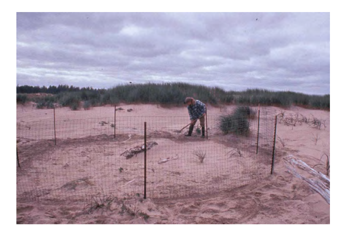
Figure 8. Erecting western snowy plover exclosure (photo by Sue Powell, with permission).

Although exclosures are contributing to improved productivity and population increases in some portions of the western snowy plover's Pacific coast range, problems have been noted in some localities. Potential risks associated with exclosures include vandalism, disturbance of the birds by curiosity seekers, and use of exclosures as predator perches. Over time, exclosures may provide a visual cue to predators, making it easier for them to target adults, chicks, and eggs, and requiring predator management. On several occasions depredations of adult western snowy plovers have been documented in or near exclosures, and efforts have been made to establish exclosures later in the season after the peak migration of raptors (Brennan and Fernandez 2004, Lauten et al. 2006). Also, predator exclosures may be impractical where western snowy plovers nest within California least tern colonies or other instances where such exclosures may conflict with the needs of other threatened or endangered species.