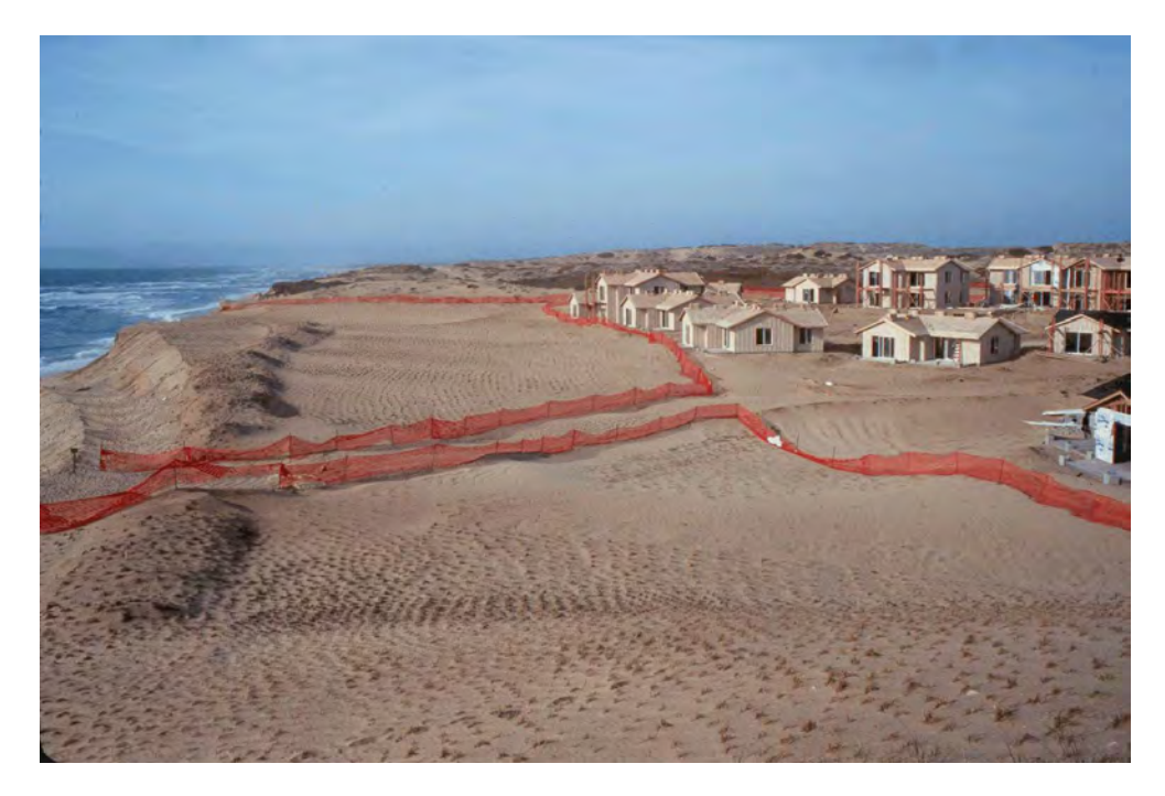
Figure 5. New housing development next to beach at Monterey Bay, California.

incubating western snowy plovers, destroy their nests or chicks, and result in the loss of invertebrates and natural wave-cast kelp and other debris that western snowy plovers use for foraging. Mining of surface sand from the 1930s through the 1970s at Spanish Bay in Monterey County degraded a network of dunes by lowering the surface elevations, removing sand to granite bedrock in many locations, and creating impervious surfaces that supported little to no native vegetation (Guinon 1988).